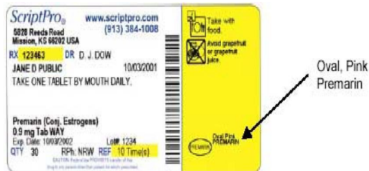
Oval, Pink Premarin

Taking too much medicine can cause an overdose. Taking too little can keep the medicine from doing its job. Always take the exact amount prescribed.